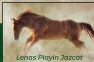
Lenas Playin Jazcat

Lenas Playin Jazcat Available for the 2020 Breeding Season!