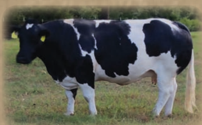
Full blood female