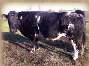
Full blood female