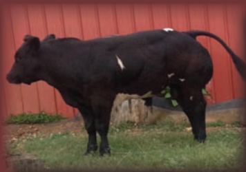
SRD Black Sargent