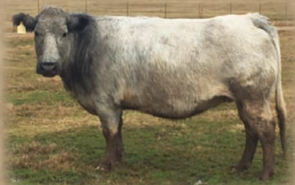
100% American Blue cow