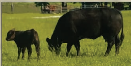
MNP Blue PixieDix

Check out our website for more information! www.mnpfarm.com