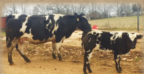
100% American Blue cow and calf