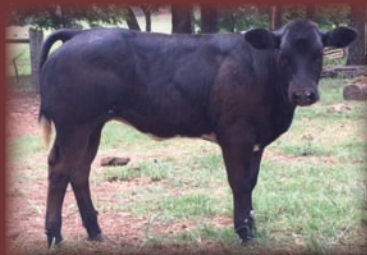
SRD Black Moon Too

FULLBLOOD • PUREBRED • PERCENTAGE BREEDING STOCK AVAILABLE