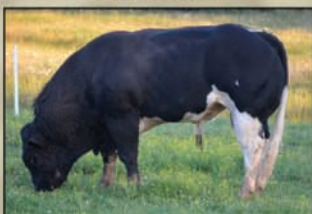
MNP Blue Mystic's Double