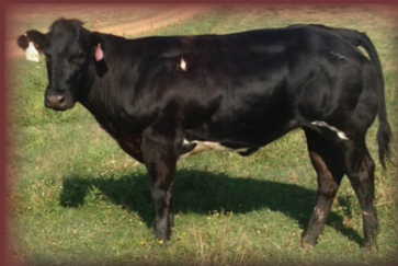
SRD Black Success ET