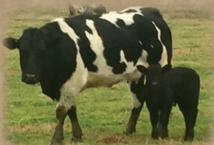
100% American Blue cow and calf