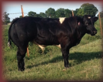
SRD Dagger Too ET