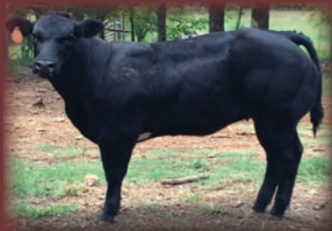
SRD Black Jubilee