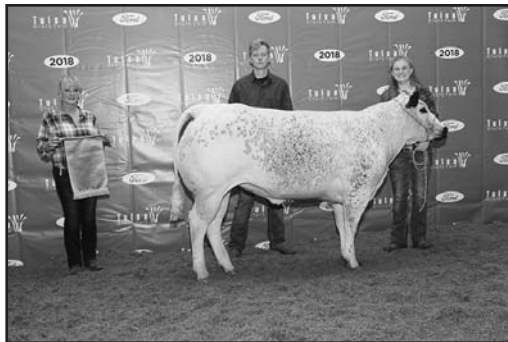
2018 National Grand Champion Female owned and shown by BGB Blues