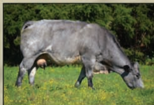
MNP Blue Demi Dix