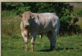
MNP Blue New Influence