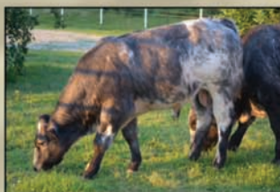
MNP Blue Dynasty's Destination