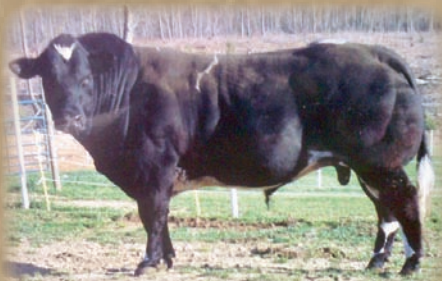
Full blood bull