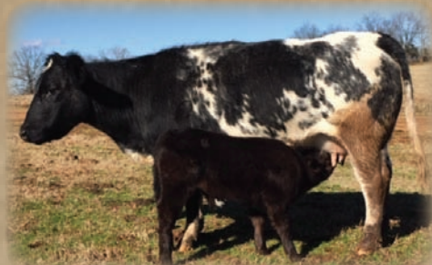
100% American Blue cow and calf