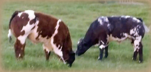
Full blood calves