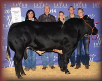
SRD Alex's Dagger ET