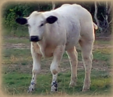
Full blood calf