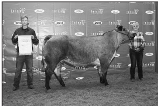
2018 National Reserve Grand Champion Female owned and shown by BGB Blues