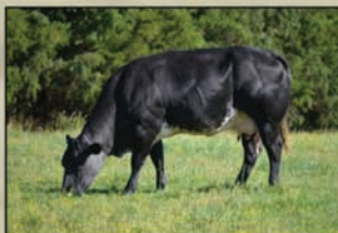
MNP Blue Affluent