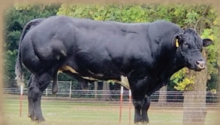
Full blood bull